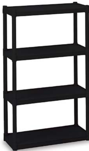
Rough n Ready 4 Shelf in Black