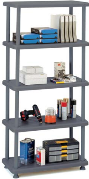
Rough n Ready 5 Shelf in Charcoal