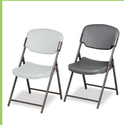
Professional looking, Rough n Ready folding chairs are available in charcoal or platinum. Open dimensions are 18-3/4" W x 21-1/2" D x 35-1/2" H.

This folding chair is extraordinarily comfortable. Ergonomically contoured, extra wide seat and back provide all-day support with a softer feel. The seat and back are constructed of blow molded high density polyethylene with soft radius edges. This gives both the seat and back a "soft" but "firm" feel. The frame is constructed of gray powder coated heavy gauge oval steel tubing with sturdy cross bracing. Non-mar plastic feet for stability. The chair is extremely strong and lightweight. Chairs "nest" for easy storage.