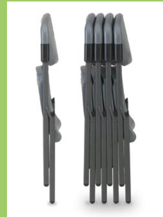
Rough n Ready Folding Chairs fold compactly and nest neatly for space saving storage. Folded dimensions are 18-3/4" W x 5-1/4" D x 44-1/2" H.