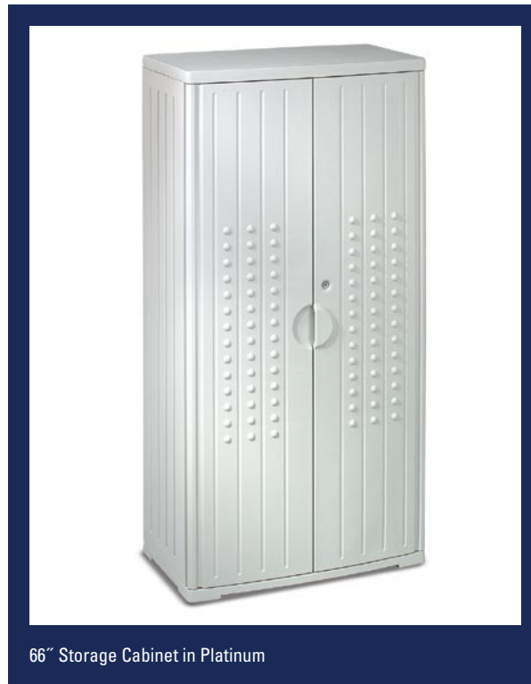
66" Storage Cabinet in Platinum

Iceberg OfficeWorks storage cabinets are the attractive, durable solution for all your storage needs. Each cabinet offers generous storage capacity to hold equipment, books, binders or office supplies. Constructed of dent and scratch resistant blow molded high density polyethylene, these cabinets will give years of use. Strong, adjustable, reinforced shelves for stability and strength. Locking doors. Assembles quickly and easily with only a screwdriver. Available in black, charcoal or platinum color.