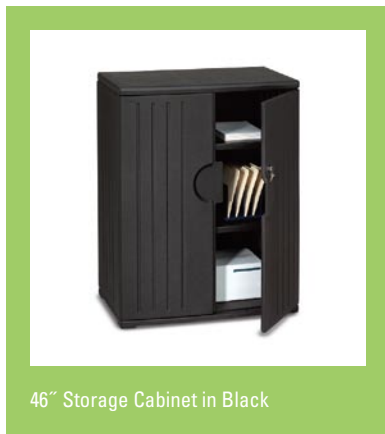
46" Storage Cabinet in Black