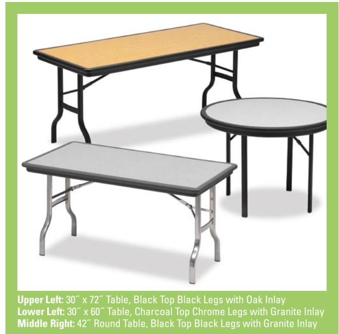
Upper Left: 30" x 72" Table, Black Top Black Legs with Oak Inlay Lower Left: 30" x 60" Table, Charcoal Top Chrome Legs with Granite Inlay Middle Right: 42" Round Table, Black Top Black Legs with Granite Inlay

The ultimate in durability, design and function, IndestrucTables™ are ideal for use in offices, banquets or any temporary work environment. This professional looking, lightweight folding table has many unique features and finishes and will last for many years – and still look as good as new!