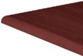
Rectangular Top Radius Edge