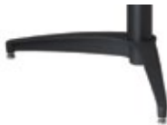
Rectangular Deluxe Base