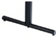
Rectangular Standard Base