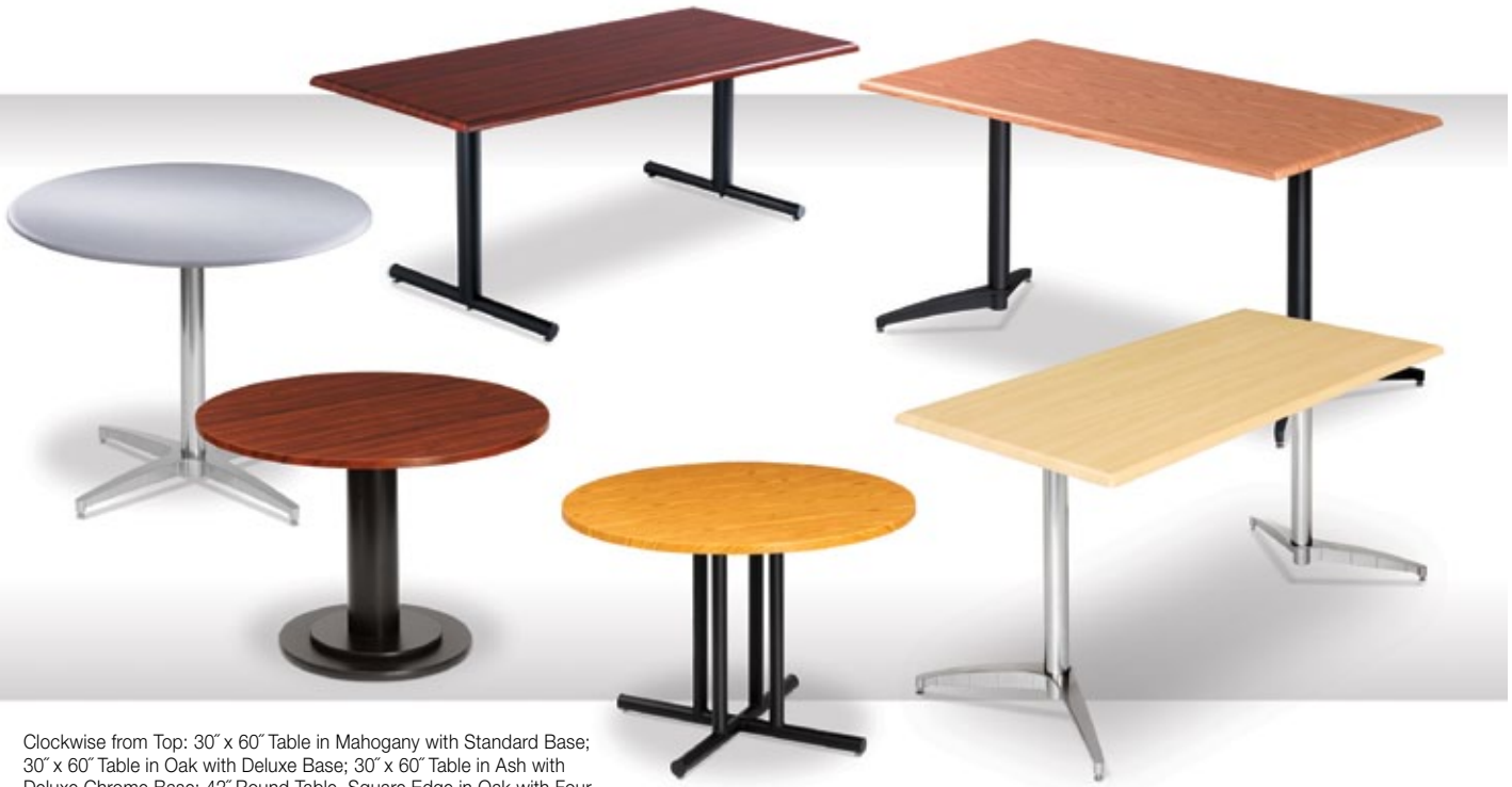
Clockwise from Top: 30" x 60" Table in Mahogany with Standard Base; 30" x 60" Table in Oak with Deluxe Base; 30" x 60" Table in Ash with Deluxe Chrome Base; 42" Round Table, Square Edge in Oak with Four-Column Base; 42" Round Table, Square Edge in Mahogany with Single Column Base; 42" Round Table, Radius Edge in Gray Granite with Deluxe Chrome Base

From private offices to conference rooms and break rooms, OfficeWorks Tables are versatile, stain-resistant and built to stand the test of time. Beautifully contoured tops yield the rich look of real wood that will enhance any office environment. Table tops are membrane pressed, extremely durable and do not require edge banding. Table tops are resistant to hot and cold temperatures as well as water stains. The table bases are heavy duty and exceptionally sturdy. The standard base and upright have powder coated, heavy gauge steel to resist scuffs and scratches, while the deluxe base offers an aluminum die cast base with a powder coated upright in either a black or chrome finish. The four-column base has a radius edge with four 2" diameter steel columns and a 31" spread. The single column base has a circular platform, 6" column center post with a 23-1/2" spread. Table height 29".