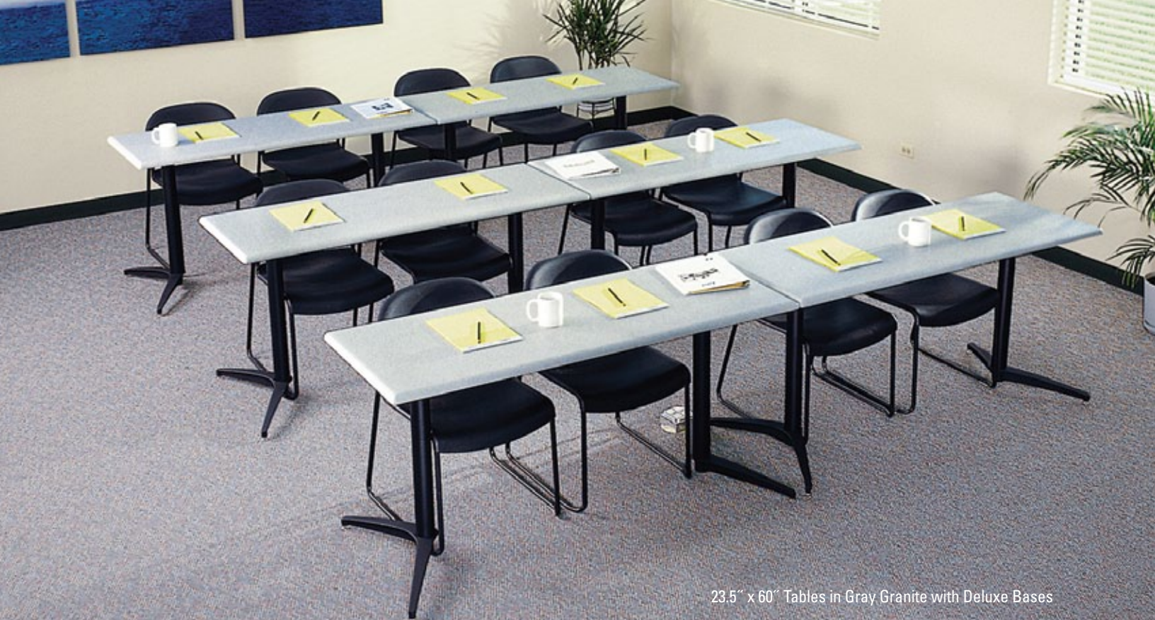
23.5" x 60" Tables in Gray Granite with Deluxe Bases