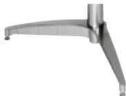
Rectangular Deluxe Chrome Base